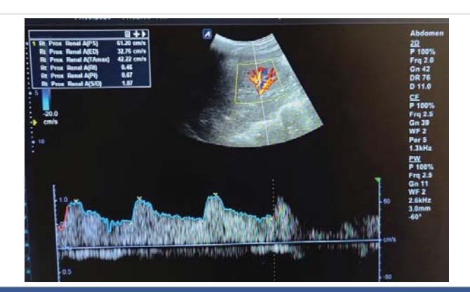
Figure 2: Spectral waveforms of upper pole interlobar renal artery showing Resistivity Index (RI) and Pulsatility Index (PI) and other Doppler indices (PS: Peak Systolic Velocity, ED: End-Diastolic Velocity, S/D: Systolic Diastolic Ratio, TA max: Time Average Mean Velocity).