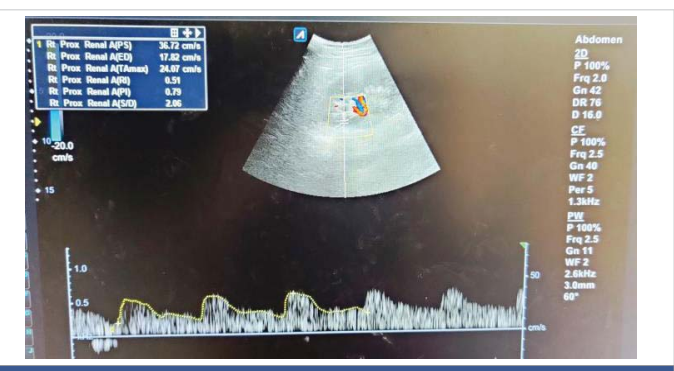
Figure 1: Spectral waveforms of mid-pole interlobar renal artery showing Resistivity Index (RI) and Pulsatility Index (PI) and other Doppler indices (PS: Peak Systolic Velocity, ED: End-Diastolic Velocity, S/D: Systolic Diastolic Ratio, TA max: Time Average Mean Velocity).