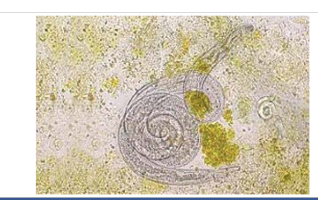
Figure 1: Strongylodes stercoral in stool examination