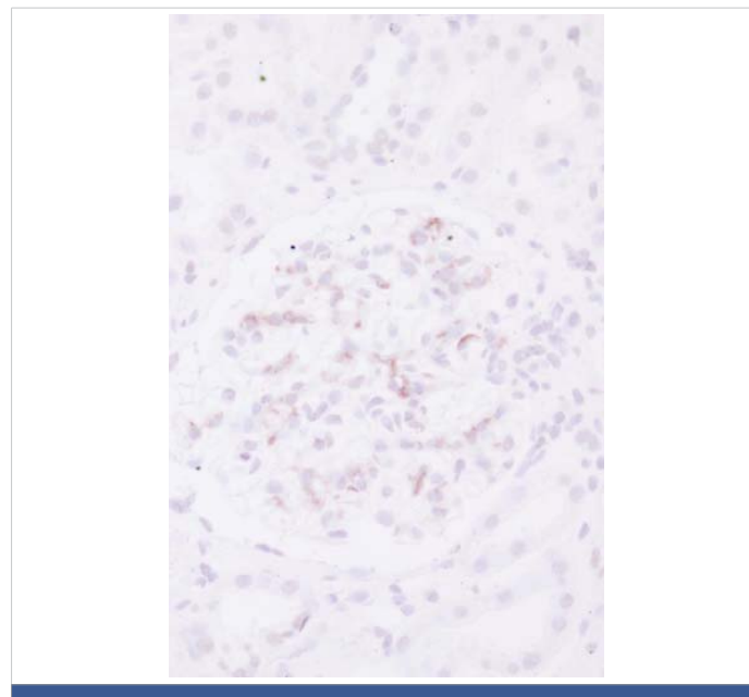
Figure 2: Immunohistochemistry showing glomerular IgA-deposits (I.)