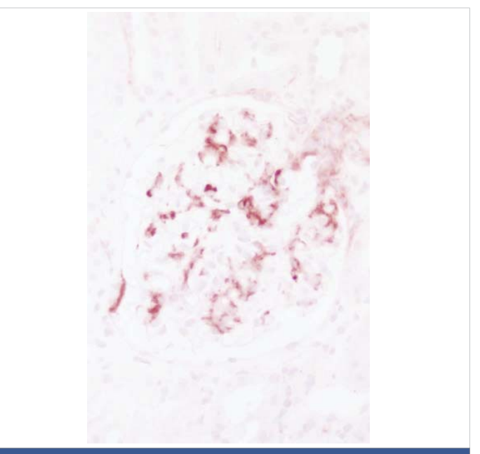
Figure 3: Immunohistochemistry showing glomerular C3d deposits (r.).