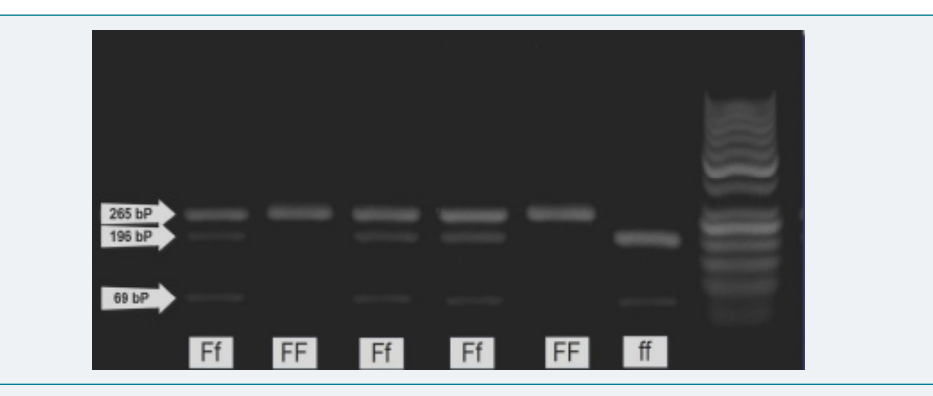
Figure 2: Agarose gel electrophoresis of PCR products digested with Fokl restriction enzyme visualized by ethidium bromide.