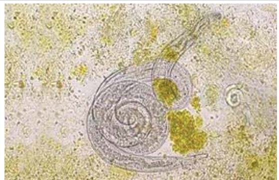
Figure 1: Strongyloides stercoralis in stool examination.