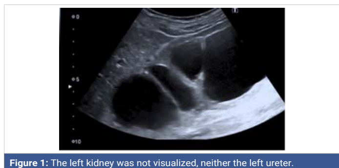
Figure 1: The left kidney was not visualized, neither the left ureter.

Considering these data, as well as the family history, the hypothesis of hereditary CKD was considered, namely autosomal dominant tubulointerstitial kidney disease (ADTKD), specifically related to HNF-1 \beta gene, or mitochondrial disease, namely MIDD.