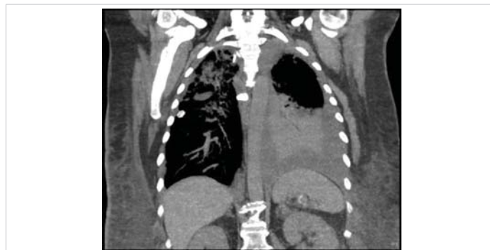
Figure 1: CT scan.

Examination of a glomerulus by electron microscopy shows patent capillary loops, the glomerular capillary basement membranes are thickened up to 3-5 times normal. Mesangial matrix expansion is noted. There is severe foot process effacement of the podocytes. No immune type electron