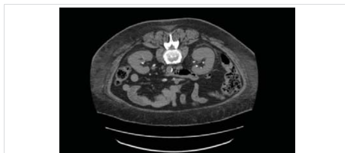
Figure 2: CT scan.